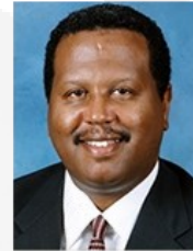
Commissioner Grady Prestage Fort Bend County, Precinct 2