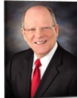
Commissioner Andy Meyers Fort Bend County Precinct 3